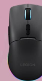
Lenovo Legion M220 Wireless RGB Gaming Mouse GY51U28359