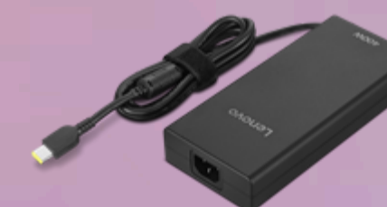
Lenovo Legion 400W AC adapter (Slim Tip)-EU GX21T68202

Please click here to view the full list of accessories.