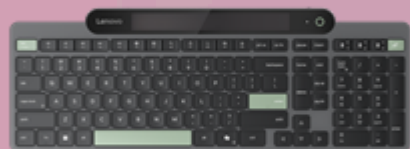
Lenovo Self-Charging Bluetooth Keyboard-French Canadian 058 4Y41R69498