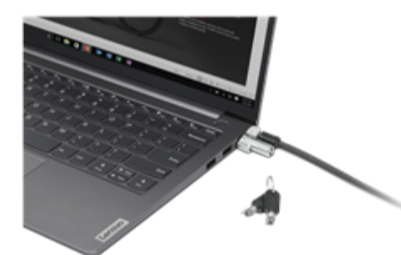
NanoSaver Cable Lock from Lenovo