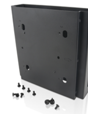
ThinkCentre Tiny Sandwich Kit II