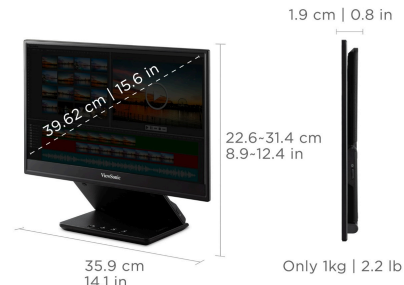
FULL HD (1920 x 1080p) Resolution