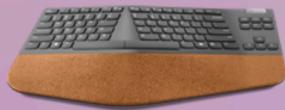
Lenovo Go Wireless Split Keyboard-US English 4Y41R64755

Please click here to view the full list of accessories.