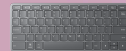
Lenovo Multi-Device Wireless Keyboard ZG38C05810