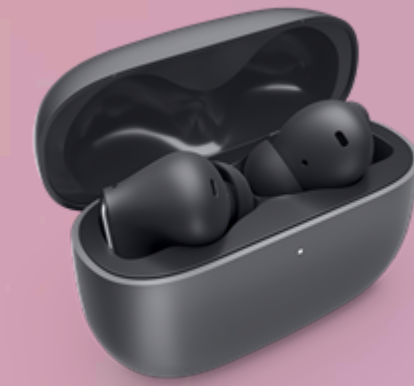
Lenovo TWS Earbuds (X9 Edition)-NA Version 4XD1S14145