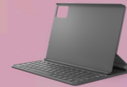
Lenovo Folio Keyboard for IdeaTab ZG38C07087