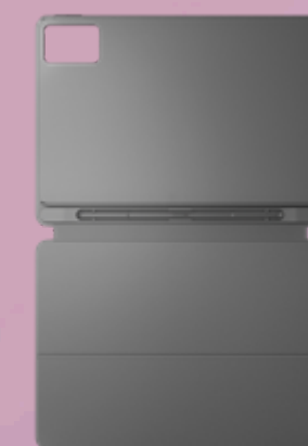
Lenovo Idea Tab Folio Case ZG38C06984