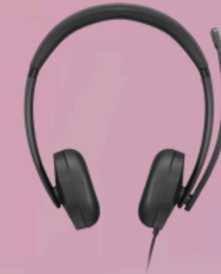
Lenovo Wired VoIP Headset 5000 (Teams) 4XD1R88995