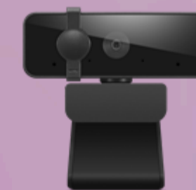
Lenovo Essential FHD Webcam Gen2 4XC1S15018

Please click here to view the full list of accessories.