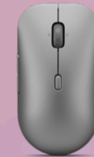
Lenovo Wireless Multi-Mode Pro Plus Mouse 6050 (Luna Grey) 4Y51S61878