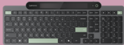
Lenovo Self-Charging Bluetooth Keyboard-French Canadian 058 4Y41R69498