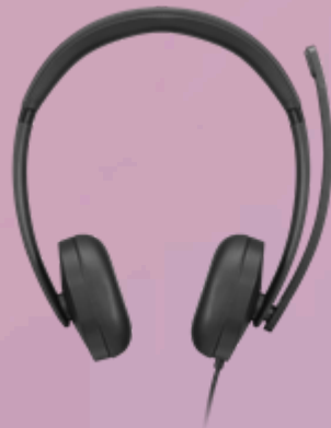
Lenovo Wired VoIP Headset 5000 4XD1R88995