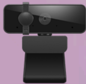
Lenovo Essential FHD Webcam Gen2 4XC1S15018

Please click here to view the full list of accessories.