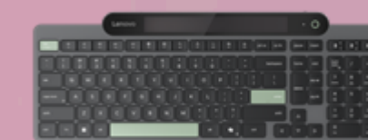
Lenovo Self-Charging Bluetooth Keyboard-French Canadian 058 4Y41R69498