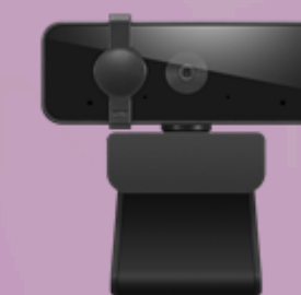
Lenovo Essential FHD Webcam Gen2 4XC1S15018

Please click here to view the full list of accessories.